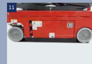
Anti-overturning system: When the machine raises to more than 6.5ft, this system will work automatically, to protect the machine from overturning while walking on un-leveling ground.