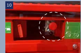
Manual release valve: When the machine can not move, you can push the machine after pressing this valve