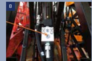
Explosion proof valve: To prevent the machine falling when the oil pipe is leaking