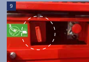
Manual lowering valve: When the operation system failed or the battery power is too low to let the platform decline, we can use this valve to lower the machine