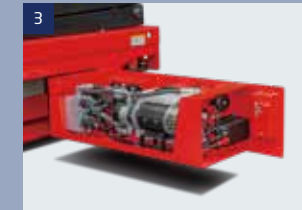
Hydraulic and electric system