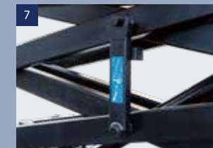
Supporting arms: To protect the operator when he is doing repair or maintenance job