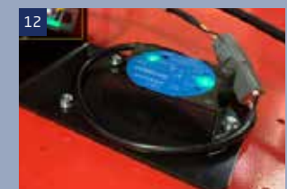
Angle sensor: when it is lifting and walking on the slope, the sensor will automatically judge the status of the machine, if the angle is larger than the rated angle, it will alarm to remind the operator.